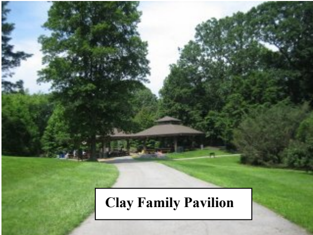
Clay Family Pavilion

About 35 members gathered at the Clay Family Pavilion in the Bronx Botanical Garden to share such food as sandwiches, fruit, chips, cheese, and cookies. This is a recently reopened area with multiple tables and a large roof with convenient bathrooms (sadly lacking up to now). The food was plentiful and delicious - but the biggest hit was Joyce Melito's strawberry shortcake. Which by time we had attacked with gusto - looked a little sad. We had lots of time to chat and play "Botticelli."