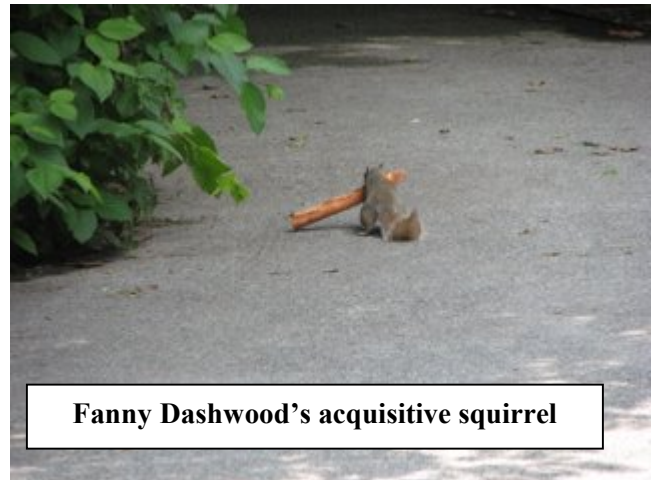
Fanny Dashwood's acquisitive squirrel