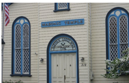
The Masonic Temple (1796) is only one example of the lovely Austen period houses in the town